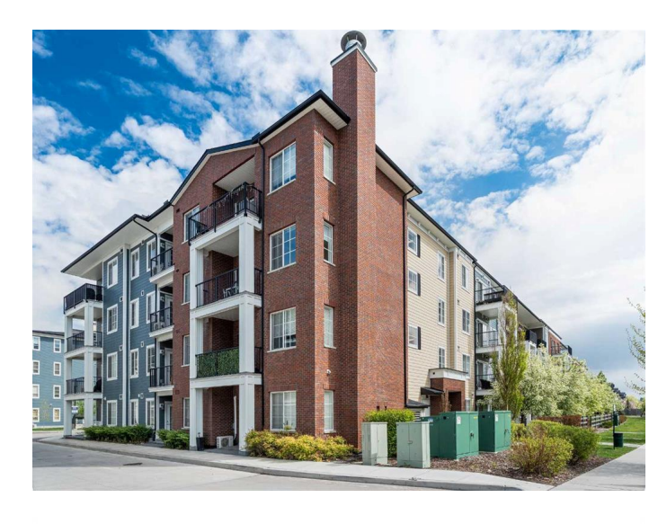
7309-151 Legacy Main St SE, Calgary, AB

Don't miss your chance to call this homeâ€"schedule your showing today!