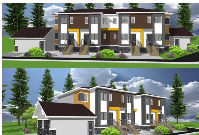
7840 Bowcliffe Crescent NW, Calgary, AB

Main Floor Exterior Area 907.28 sq ft Interior Area 839.67 sq ft